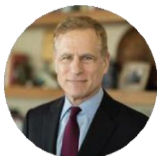
Robert Kaplan Co-Chairman, Draper Richards Kaplan Foundation (Former President and CEO, Federal Reserve Bank of Dallas)