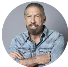
John Paul DeJoria Entrepreneur and Philanthropist, Co-Founder, Paul Mitchell Systems and Patron Spirits International