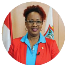
Hon. Silveria E. Jacobs Prime Minister, St. Maarten